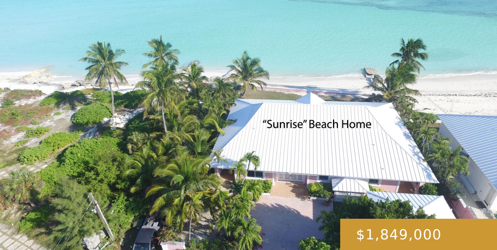
"Sunrise" Beach Home